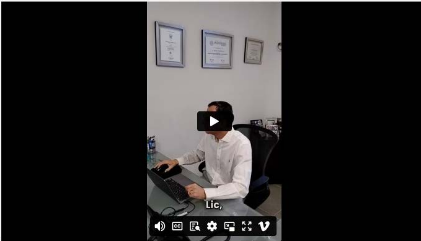
Watch the auction invite video!